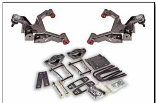
2007 - 2014 Tundra