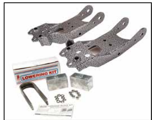
1988 - 1996 Toyota Pick Up