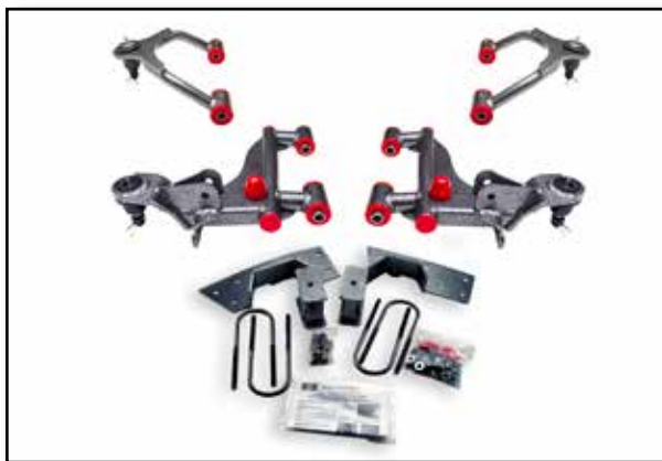
2005 - 2014 Tacoma

Complete kits are the best way to insure you get everything you need to lower your truck, add Calmax SuperShocks and you're ready to go! Note: Tacoma and Tundra Kits with ball joints installed are available for retail sales only.