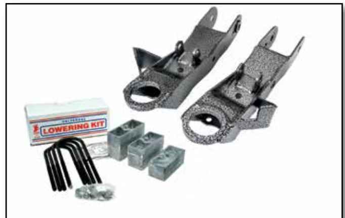
1986 1/2 - 1997 Nissan Hardbody