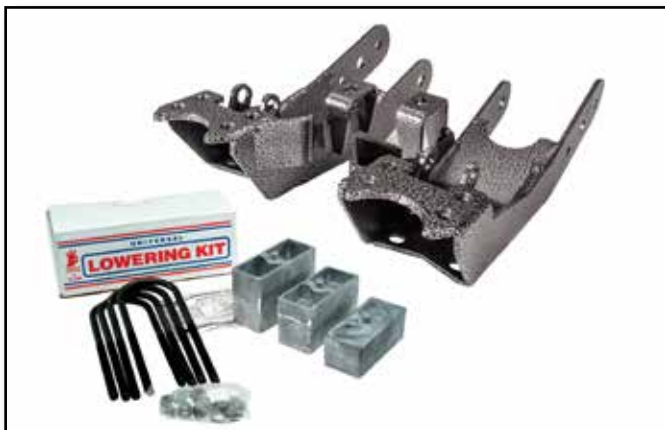
1986 - 1993 Mazda Pick Up