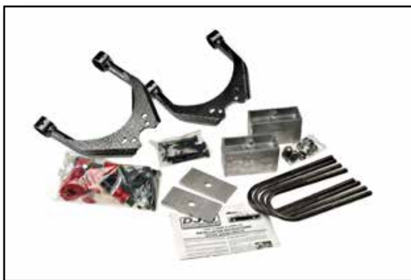
1995 - 2004 Tacoma