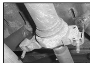
Remove factory bracket from cross member.

Take truck for test drive. If drive line vibration occurs, with 2 piece drive shafts, install the Carrier bearing bracket #CB99 (included with HS2504-4X) to correct drive line angle. Check all bolts for correct torque.