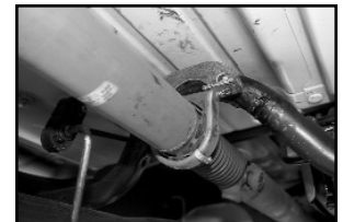
Position new bracket and drill two holes to attach bracket.

Check out all the DJM products on the web www.DJMSuspension.com