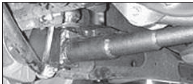
Typical beam installed