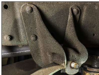
The original spring hanger is attached with rivets that must be removed