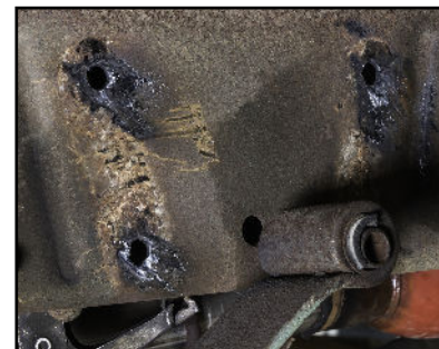
When the rivets are removed clean up the frame. The new hanger will bolt directly to the existing holes