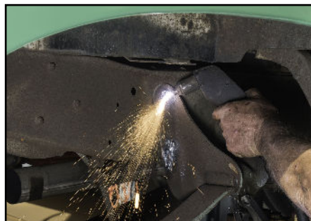
There are many ways to remove the rivets we used and small plasma cutter for fast work