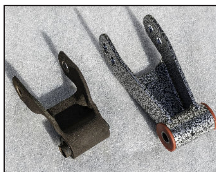
This is the original shackle and the DJM shackles. It's easy to fit the new shackles when the leaf spring is removed