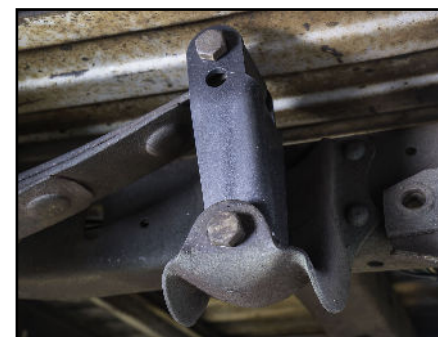
The new DJM shackle installed. Do not tighten the bolts until the first test drive. Just snug the red bushings.